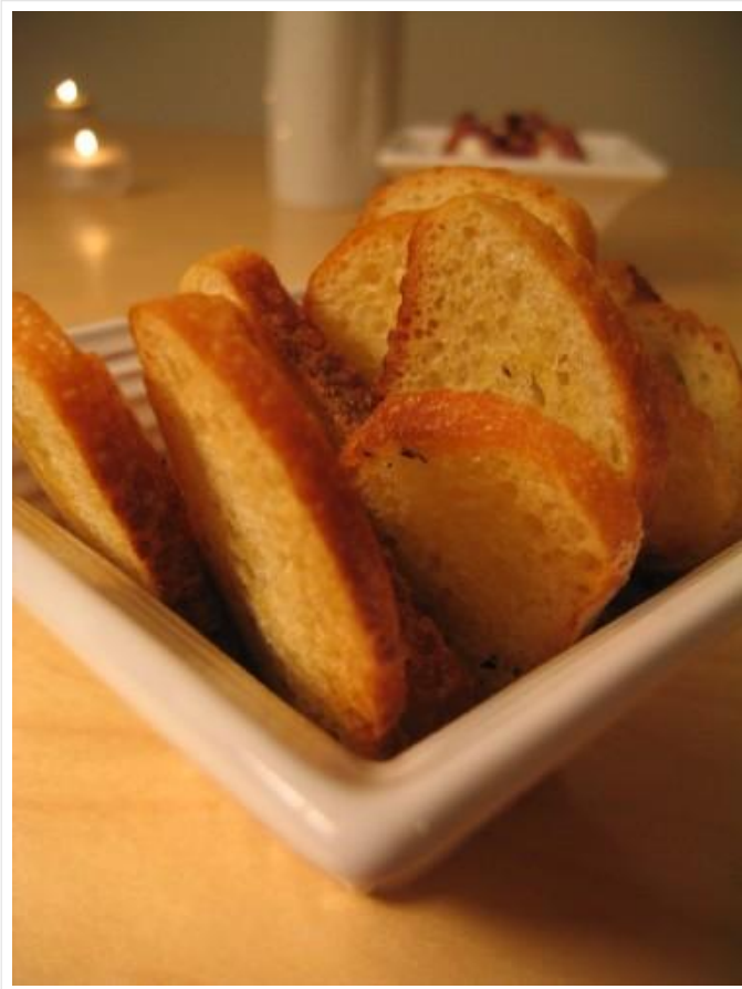
Homemade Ricotta with Maple Syrup, Bacon & Crostini