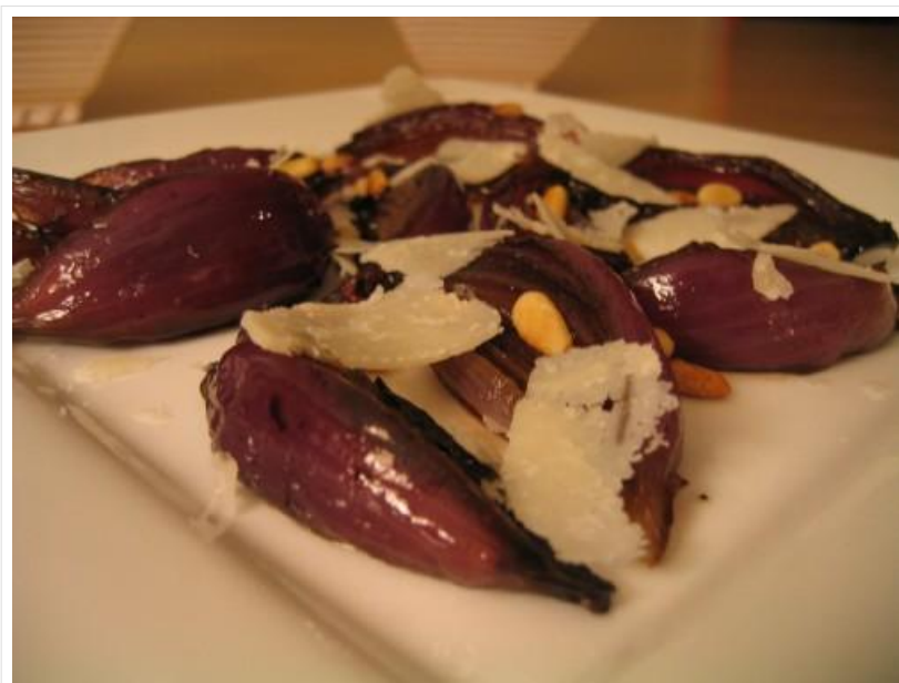
Balsamic Roasted Onion with Toasted Pinenuts & Parmigiano