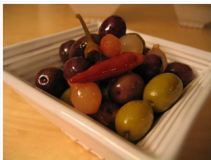
Hot Tunisian Olives

Ricotta is an Italian cheese that is made from whey. So technically it's not a cheese but a byproduct. Homemade ricotta recipes usually use milk and an acid in the form of lemon juice, vinegar or buttermilk. I never even thought of making ricotta cheese at home until I read about it on Becks & Posh . The first